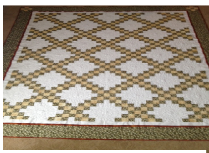
"Double Irish Chain"

We really need people to be here to help and make connections to the vendors and also to the guests we will have that day.